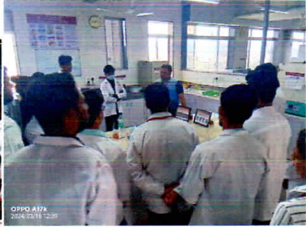
Drug Research Lab