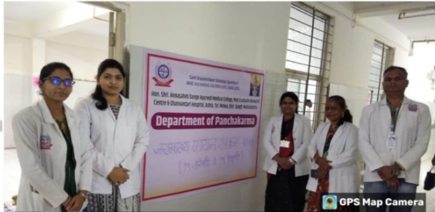
Jaraswatha Rasayan upakram 2024 Organised by Department of Panchkarma.